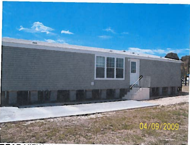
REAR VIEW 4/9/09