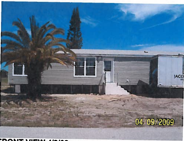
FRONT VIEW 4/9/09

If using the Elevation Certificate to obtain NFIP flood insurance, affix at least two building photographs below according to the instructions for Item A6. Identify all photographs with: date taken; "Front View" and "Rear View"; and, if required, "Right Side View" and "Left Side View." If submitting more photographs than will fit on this page, use the Continuation Page, following.