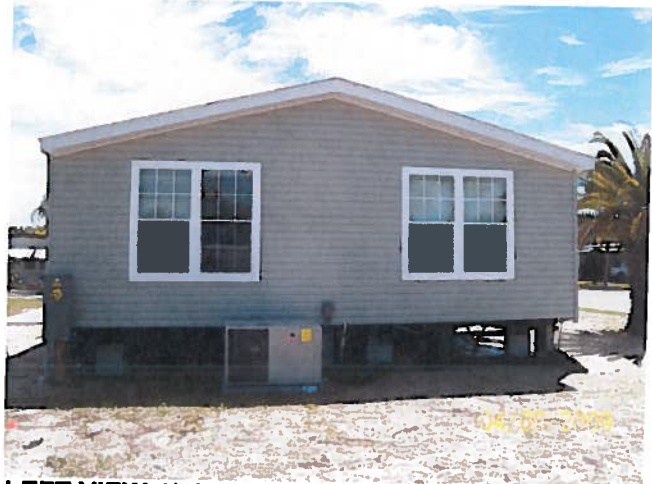
LEFT VIEW 4/9/09