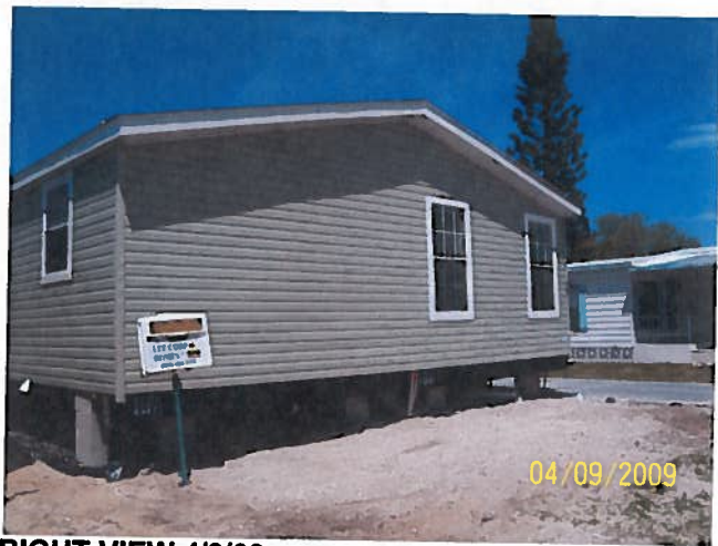
RIGHT VIEW 4/9/09