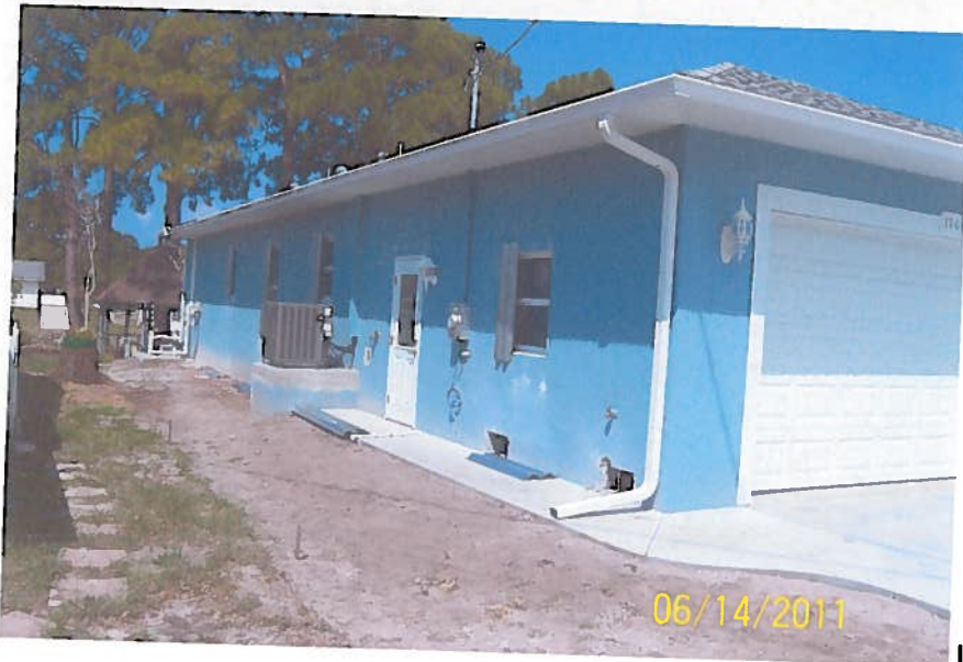
Left side with air conditioner pad and (2) vents