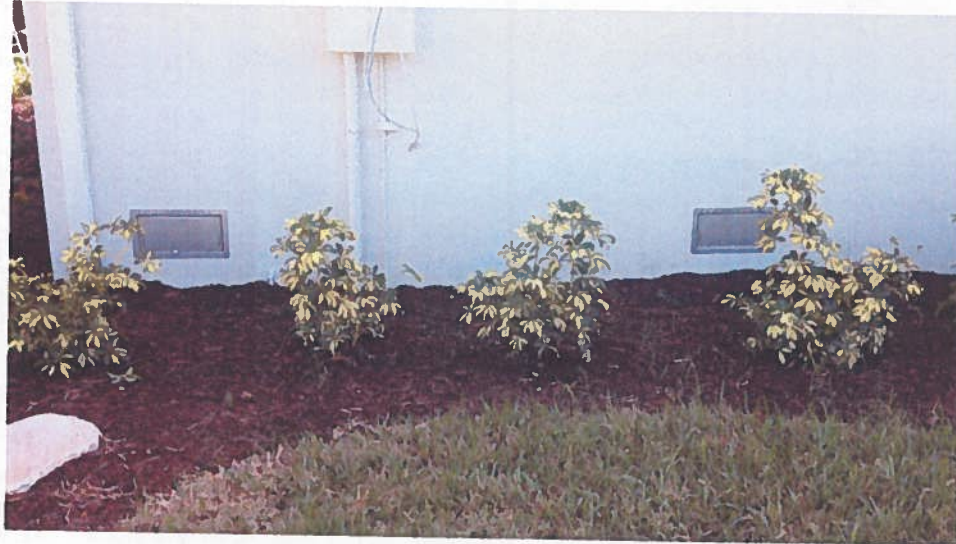
TYPICAL PERMANENT FLOOD OPENINGS IN A9.b) 10/12/2015

If submitting more photographs than will fit on the preceding page, affix the additional photographs below. Identify all photographs with: date taken; "Front View" and "Rear View"; and, if required, "Right Side View" and "Left Side View." When applicable, photographs must show the foundation with representative examples of the flood openings or vents, as indicated in Section A8.