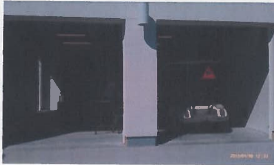
REAR VIEW 1-30-12