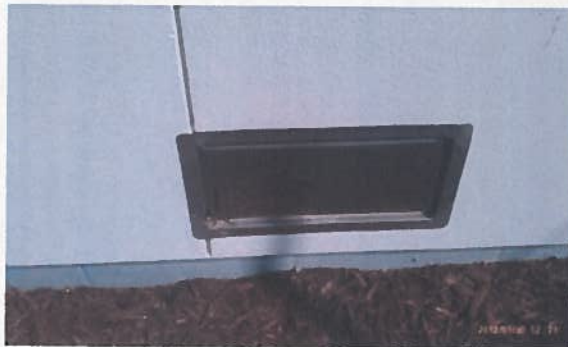
FLOOD VENT 1-30-12