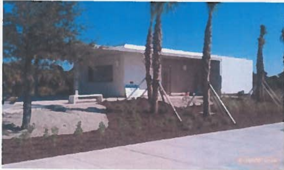
FRONT VIEW 1-30-12