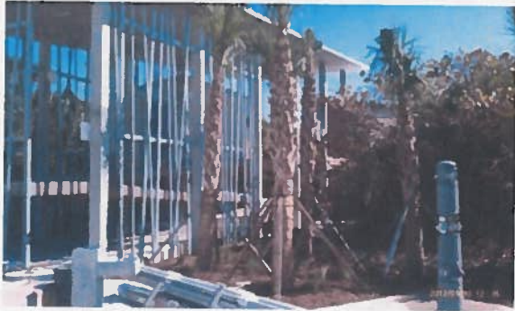
FRONT VIEW 1-30-12