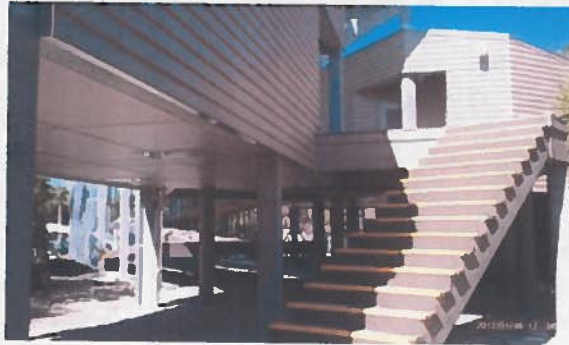
REAR VIEW 1-30-12