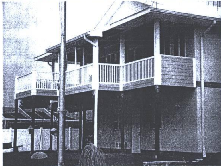
REAR VIEW AT 861 HARVARD STREET, ENGLEWOOD, FL 34223