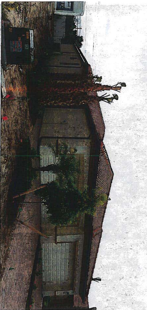
Photo One Caption FRONT VIEW

If using the Elevation Certificate to obtain NFIP flood insurance, affix at least 2 building photographs below according to the instructions for Item A6. Identify all photographs with date taken, "Front View" and "Rear View"; and, if required, "Right Side View" and "Left Side View." When applicable, photographs must show the foundation with representative examples of the flood openings or vents, as indicated in Section A8. If submitting more photographs than will fit on this page, use the Continuation Page.