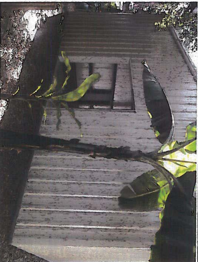
REAR VIEW 05-16-2019