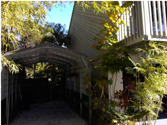
SIDE VIEW / W. SIDE 12/16/2014