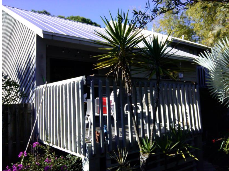
REAR VIEW / N. SIDE 12/16/2014