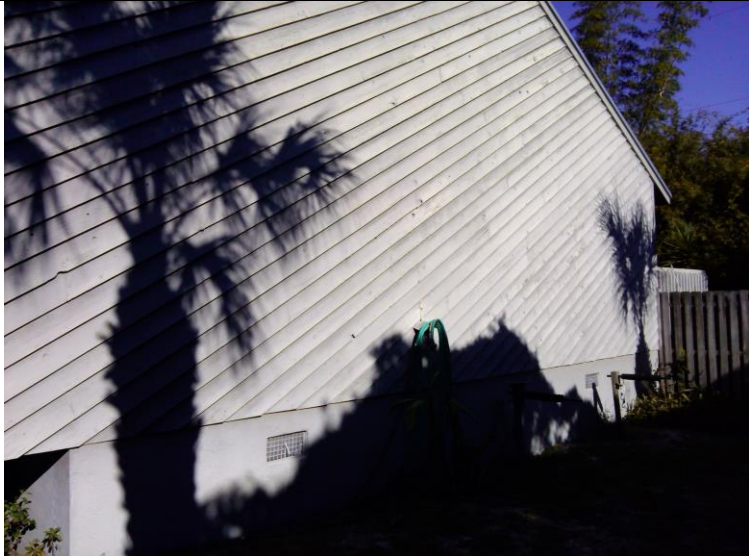
SIDE VIEW / E. SIDE 12/16/2014

If submitting more photographs than will fit on the preceding page, affix the additional photographs below. Identify all photographs with: date taken; "Front View" and "Rear View"; and, if required, "Right Side View" and "Left Side View." When applicable, photographs must show the foundation with representative examples of the flood openings or vents, as indicated in Section A8.