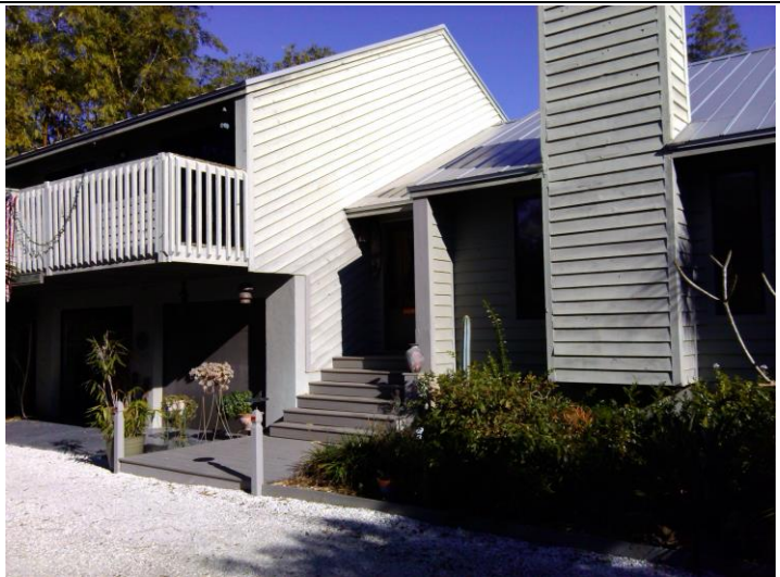
FRONT VIEW / SE. SIDE 12/16/2014