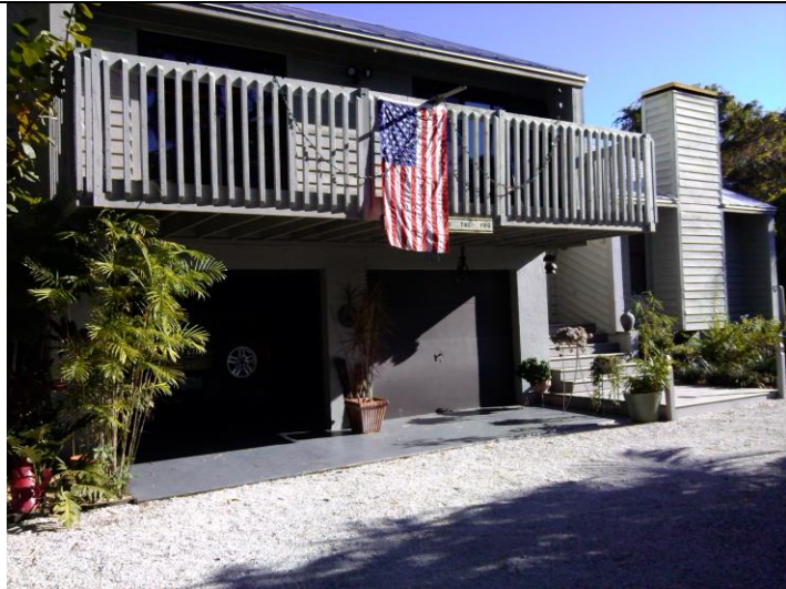
FRONT VIEW / SW. SIDE 12/16/2014

If using the Elevation Certificate to obtain NFIP flood insurance, affix at least 2 building photographs below according to the instructions for Item A6. Identify all photographs with date taken; "Front View" and "Rear View"; and, if required, "Right Side View" and "Left Side View." When applicable, photographs must show the foundation with representative examples of the flood openings or vents, as indicated in Section A8. If submitting more photographs than will fit on this page, use the Continuation Page.