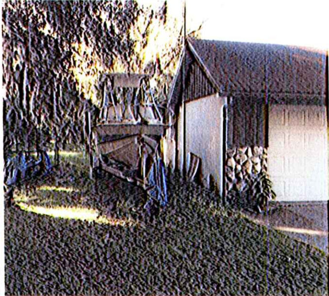
LEFT SIDE VIEW 10/31/2013