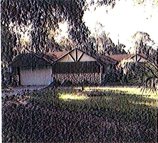
FRONT VIEW 10/31/2013