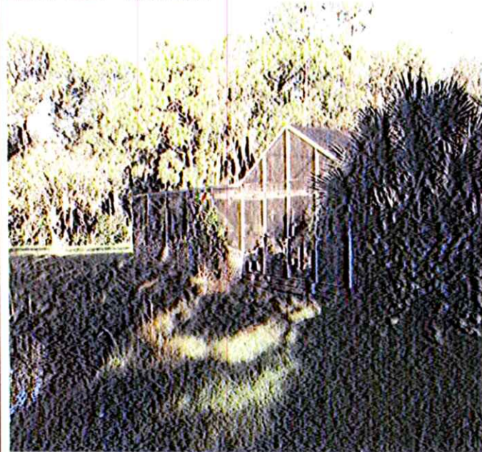
REAR VIEW 10/31/2013