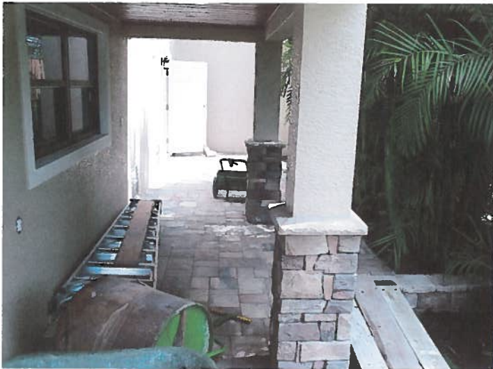
LEFT SIDE VIEW 9/8/14