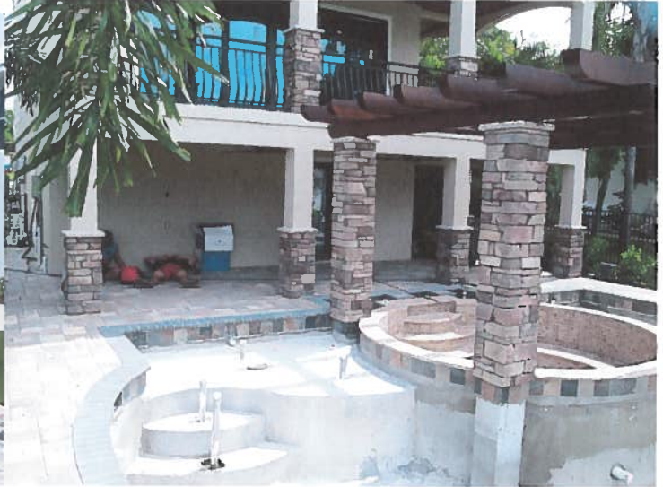
REAR VIEW 9/8/14