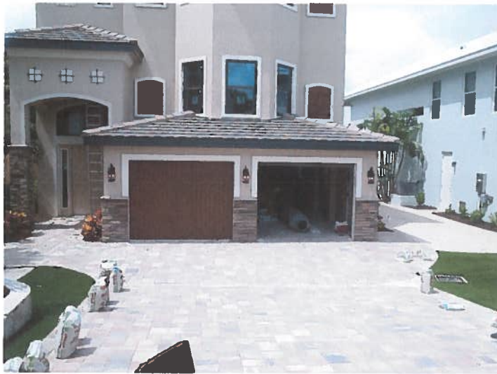
FRONT VIEW 9/8/14