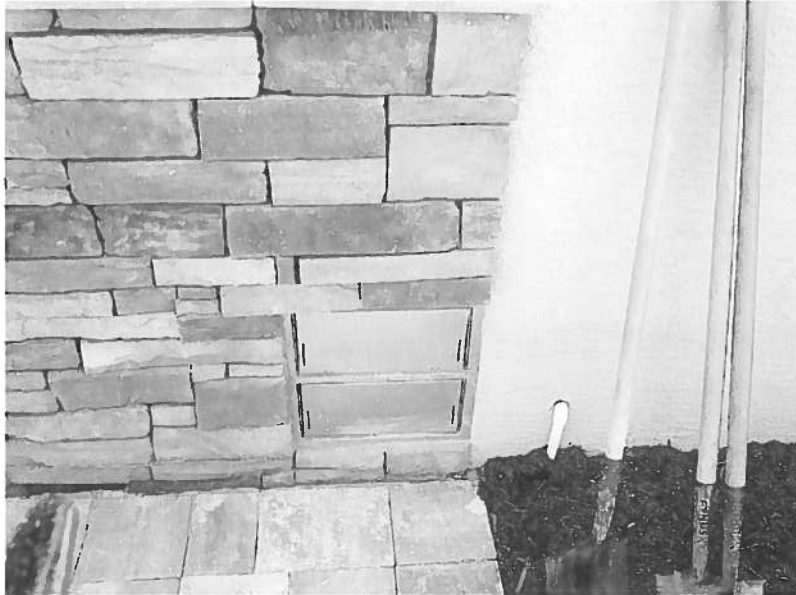
VENT - 9/8/14 SMART VENT - 1540-521

If submitting more photographs than will fit on the preceding page, affix the additional photographs below. Identify all photographs with: date taken; "Front View" and "Rear View"; and, if required, "Right Side View" and "Left Side View." When applicable, photographs must show the foundation with representative examples of the flood openings or vents, as indicated in Section A8.