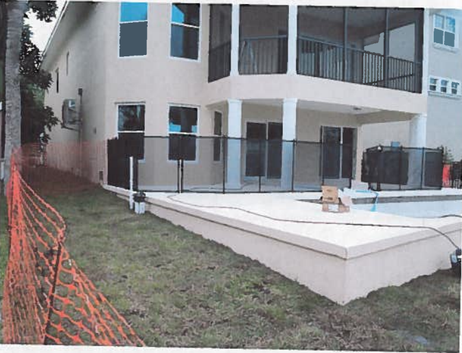
REAR VIEW 11/20/12