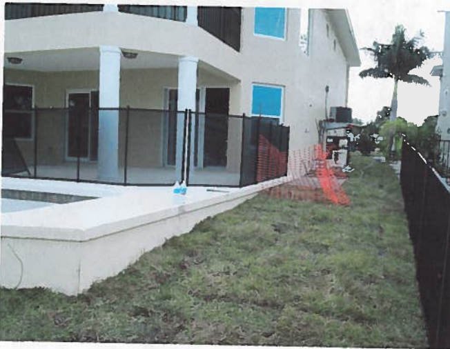
LEFT SIDE VIEW 11/20/12