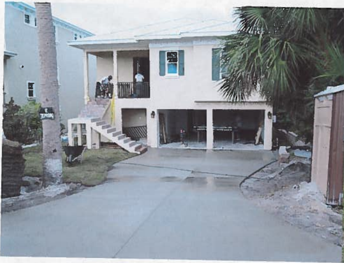
FRONT VIEW 11/20/12