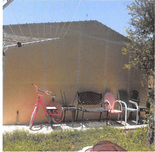
REAR VIEW 8-5-2015