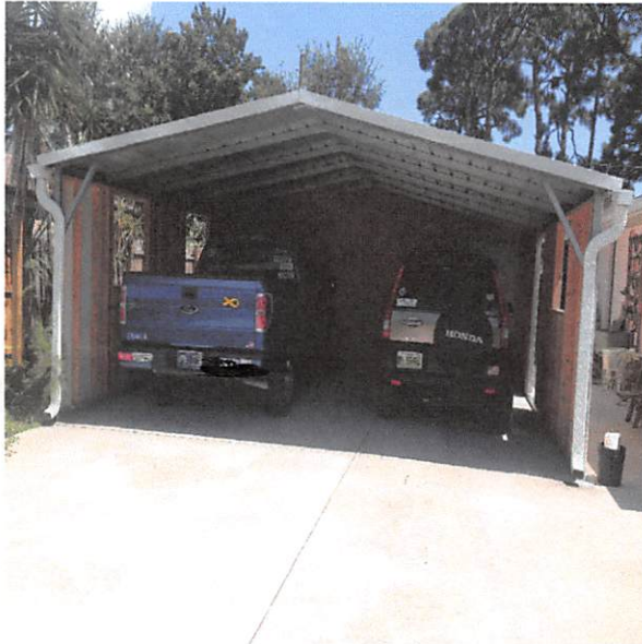
FRONT VIEW 8-5-2015

If using the Elevation Certificate to obtain NFIP flood insurance, affix at least 2 building photographs below according to the instructions for Item A6. Identify all photographs with date taken; "Front View" and "Rear View"; and, if required, "Right Side View" and "Left Side View." When applicable, photographs must show the foundation with representative examples of the flood openings or vents, as indicated in Section A8. If submitting more photographs than will fit on this page, use the Continuation Page.