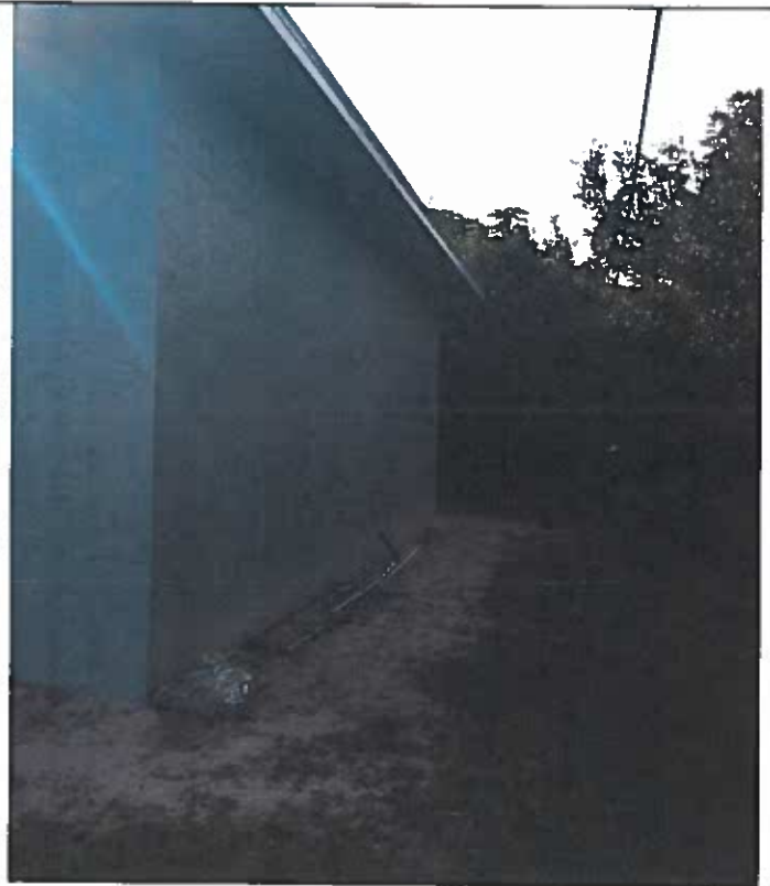
REAR VIEW 1/22/16