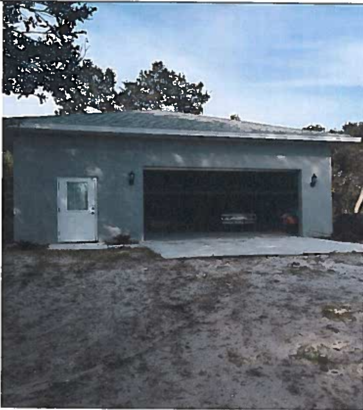
FRONT VIEW 1/22/16

If using the Elevation Certificate to obtain NFIP flood insurance, affix at least 2 building photographs below according to the instructions for Item A6. Identify all photographs with date taken; "Front View" and "Rear View"; and, if required, "Right Side View" and "Left Side View." When applicable, photographs must show the foundation with representative examples of the flood openings or vents, as indicated in Section A8. If submitting more photographs than will fit on this page, use the Continuation Page.