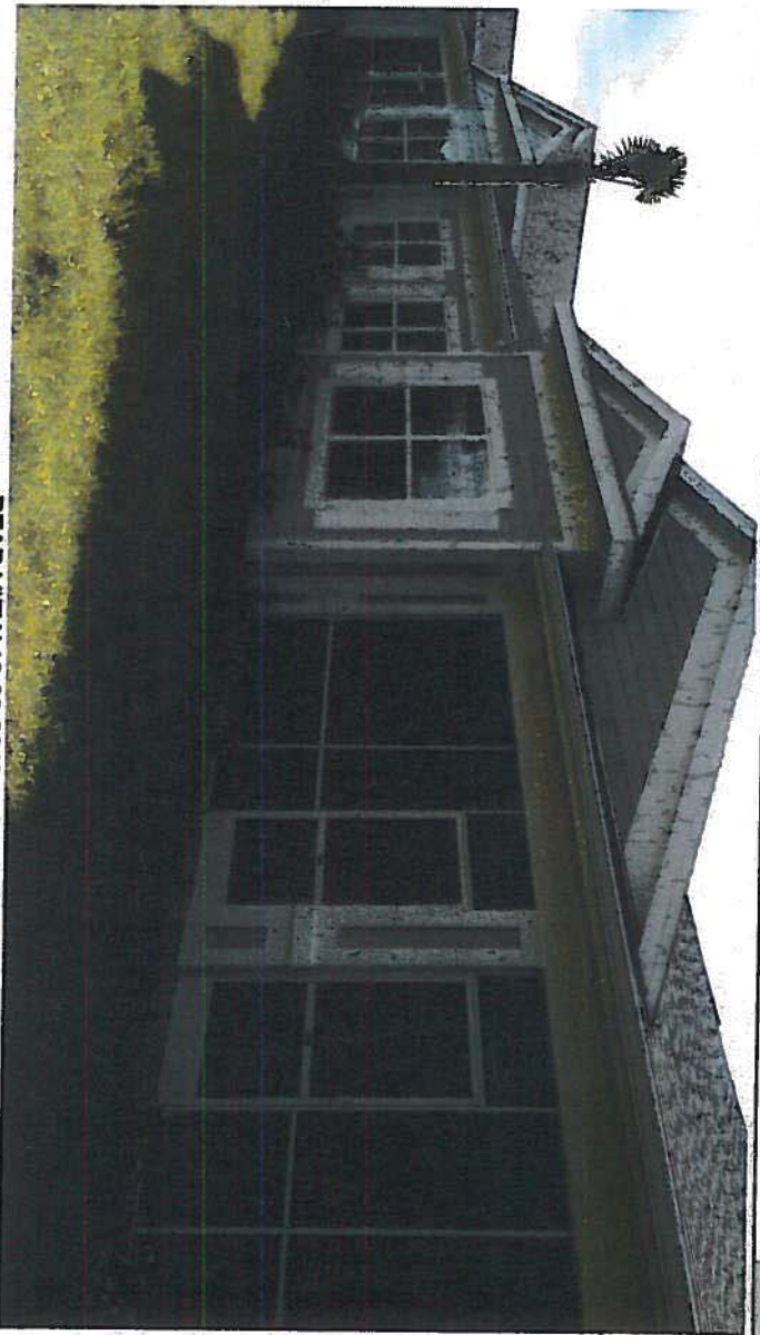
REAR VIEW 10-29-2019