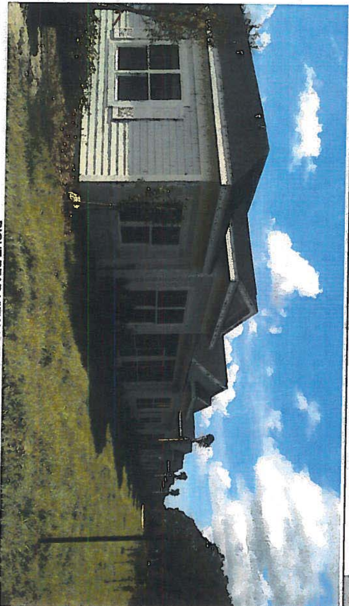
RIGHT REAR VIEW 10-29-2019