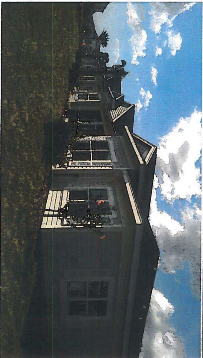
REAR LEFT VIEW 10/29/2019