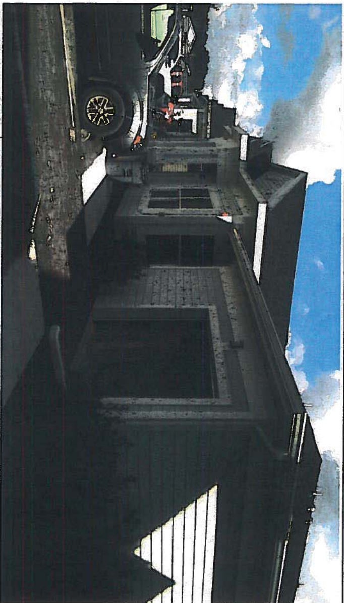
FRONT RIGHT VIEW 10/29/2019

If submitting more photographs than will fit on the preceding page, affix the additional photographs below. Identify all photographs with: date taken; "Front View" and "Rear View"; and, if required, "Right Side View" and "Left Side View." When applicable, photographs must show the foundation with representative examples of the flood openings or vents, as indicated in Section A8.