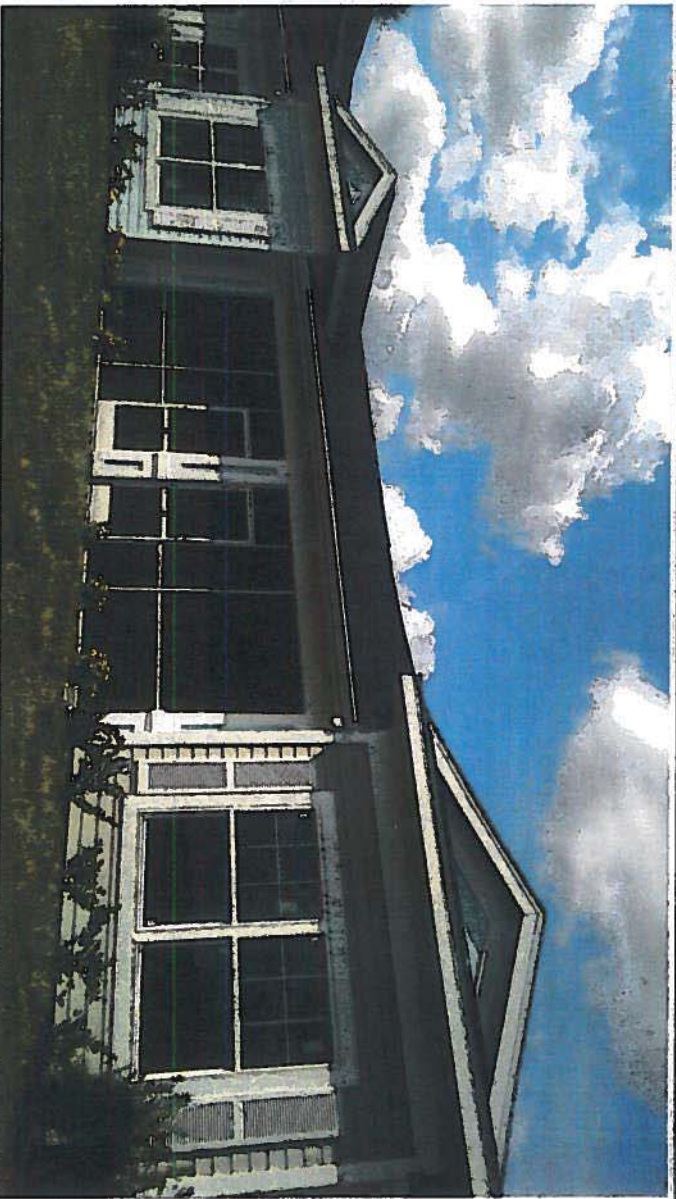
REAR VIEW 10/29/2019