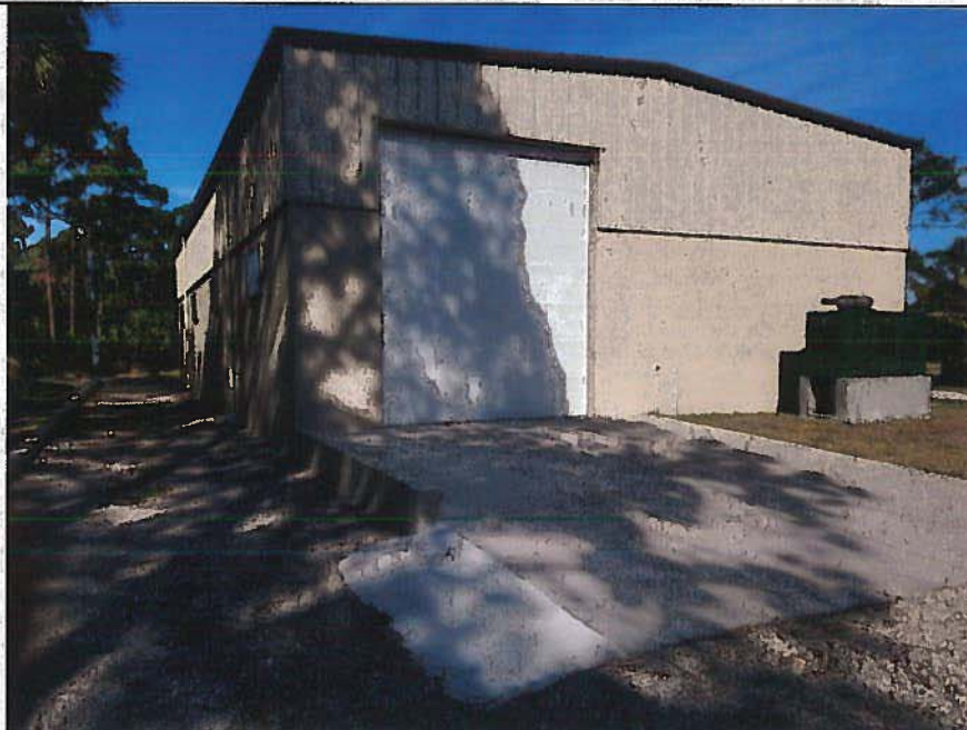
LEFT REAR VIEW 12/08/17