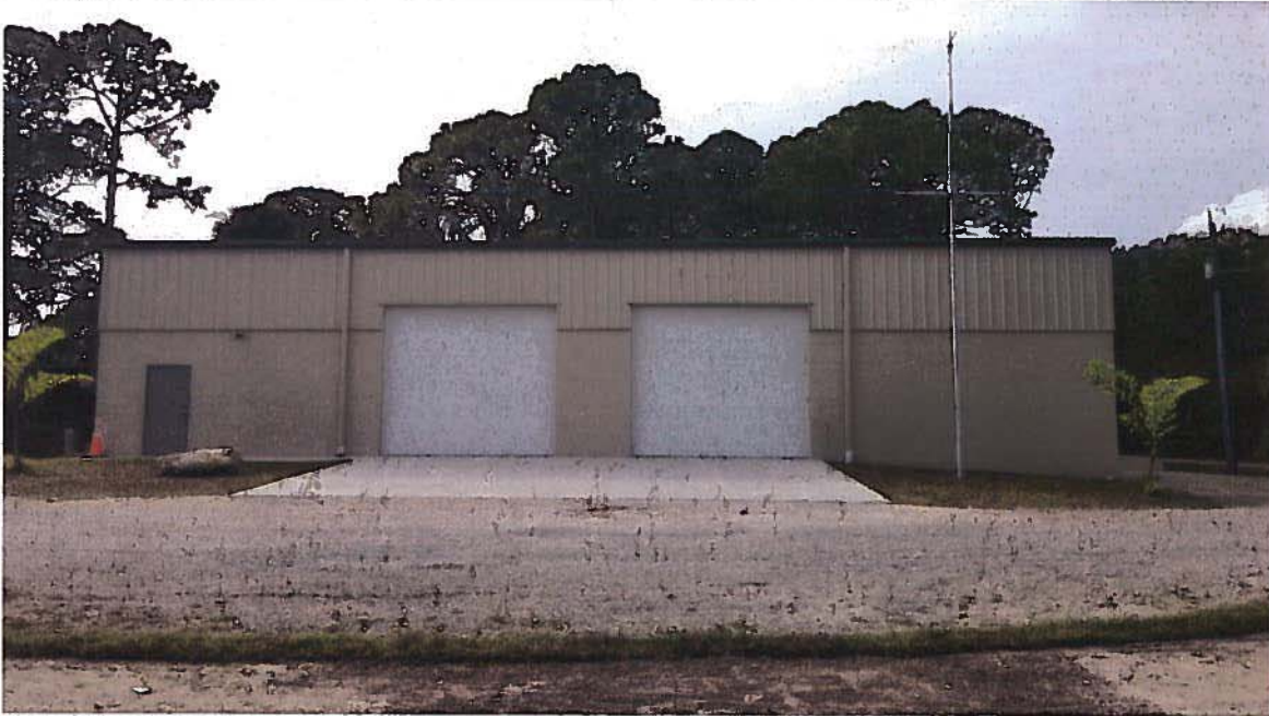
FRONT VIEW 12/08/17

If using the Elevation Certificate to obtain NFIP flood insurance, affix at least 2 building photographs below according to the instructions for Item A6. Identify all photographs with date taken; "Front View" and "Rear View"; and, if required, "Right Side View" and "Left Side View." When applicable, photographs must show the foundation with representative examples of the flood openings or vents, as indicated in Section A8. If submitting more photographs than will fit on this page, use the Continuation Page.