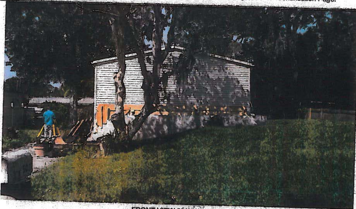
FRONT VIEW 09/15/17

If using the Elevation Certificate to obtain NFIP flood insurance, affix at least 2 building photographs below according to the instructions for Item A6. Identify all photographs with date taken; "Front View" and "Rear View"; and, if required, "Right Side View" and "Left Side View." When applicable, photographs must show the foundation with representative examples of the flood openings or vents, as indicated in Section A8. If submitting more photographs than will fit on this page, use the Continuation Page.