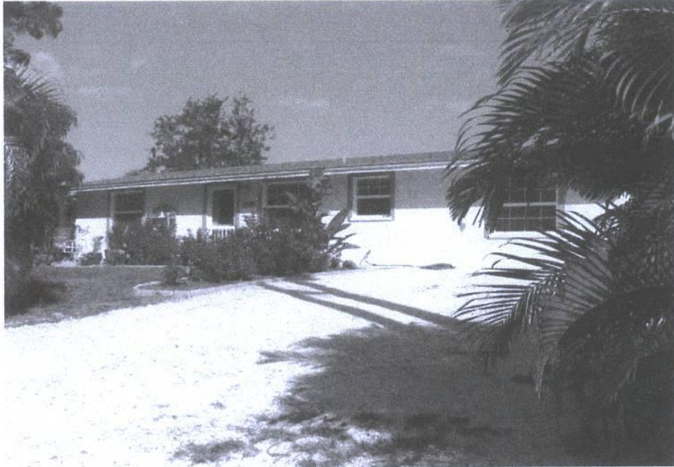
Rear view 10-22-2012