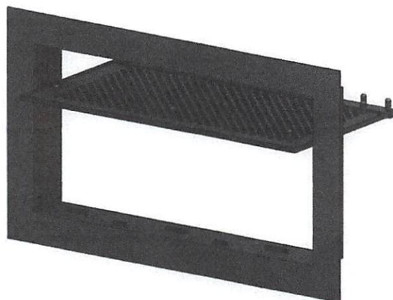
FIGURE 2—MODEL FFV-1608 FREEDOM FLOOD VENT®: SHOWN WITH FLOOD DOOR PIVOTED OPEN