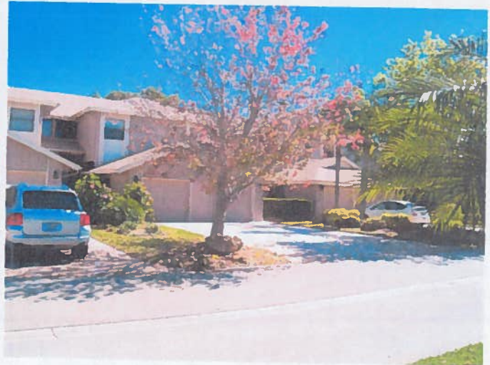
FRONT VIEWS 02/08/13