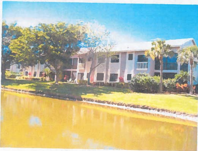
REAR VIEW 02/08/13