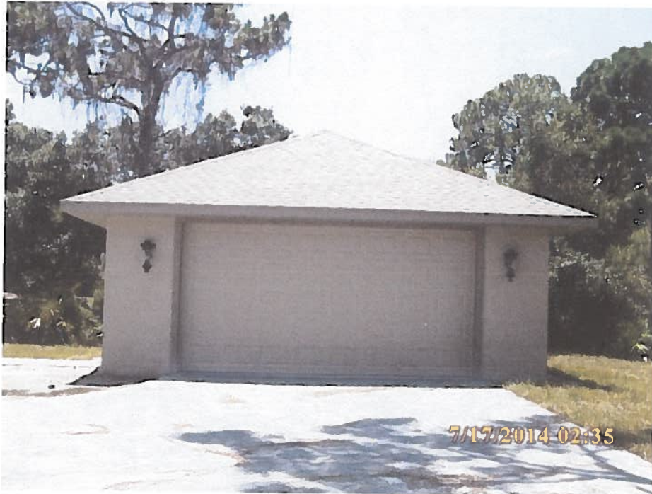
Front View 7/17/14

If using the Elevation Certificate to obtain NFIP flood insurance, affix at least 2 building photographs below according to the instructions for Item A6. Identify all photographs with date taken; "Front View" and "Rear View"; and, if required, "Right Side View" and "Left Side View". When applicable, photographs must show the foundation with representative examples of the flood openings or vents, as indicated in Section A8. If submitting more photographs than will fit on this page, use the Continuation Page.