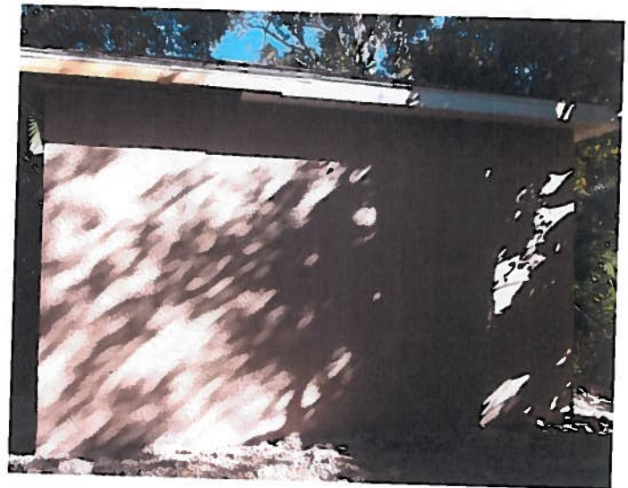
REAR VIEW 10-10-14