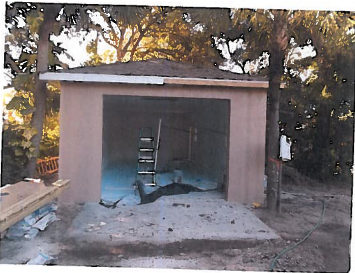
FRONT VIEW 10-10-14