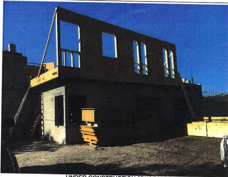
UNDER CONSTRUCTION 07/16/2020

If using the Elevation Certificate to obtain NFIP flood insurance, affix at least 2 building photographs below according to the instructions for Item A6. Identify all photographs with date taken; "Front View" and "Rear View"; and, if required, "Right Side View" and "Left Side View." When applicable, photographs must show the foundation with representative examples of the flood openings or vents, as indicated in Section A8. If submitting more photographs than will fit on this page, use the Continuation Page.