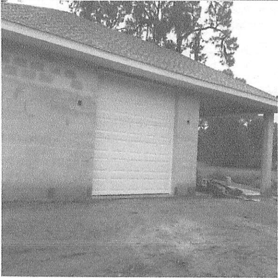
FRONT VIEW 7-23-2015

If using the Elevation Certificate to obtain NFIP flood insurance, affix at least 2 building photographs below according to the instructions for Item A6. Identify all photographs with date taken; "Front View" and "Rear View"; and, if required, "Right Side View" and "Left Side View." When applicable, photographs must show the foundation with representative examples of the flood openings or vents, as indicated in Section A8. If submitting more photographs than will fit on this page, use the Continuation Page.