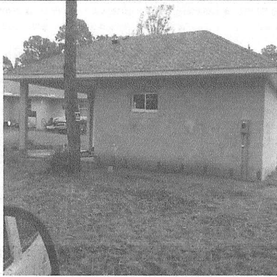
REAR VIEW 7-23-2015