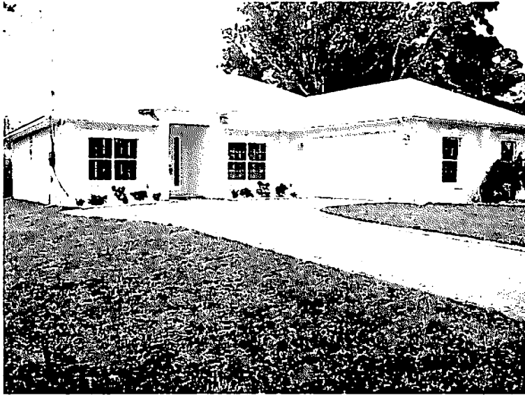
Front View 02/04/11