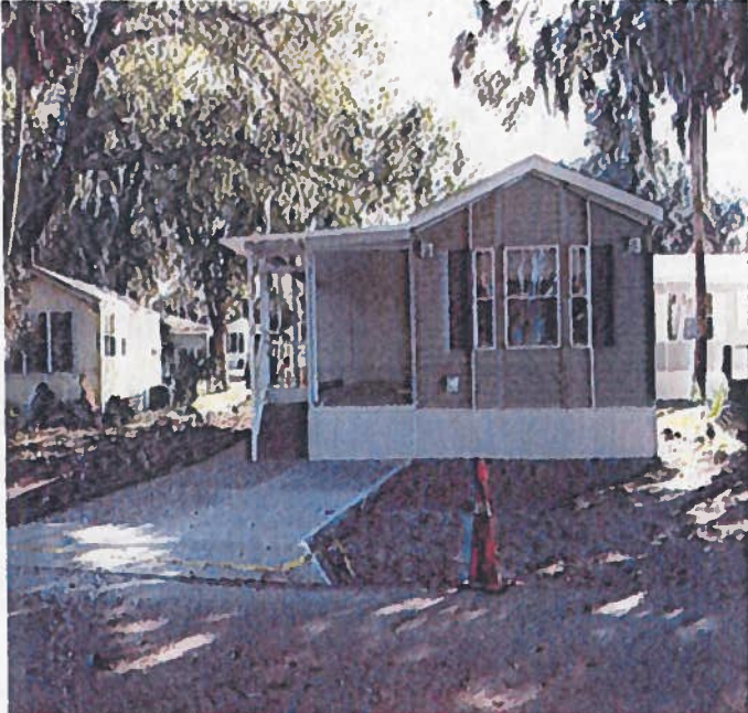
FRONT VIEW 11/08/2013