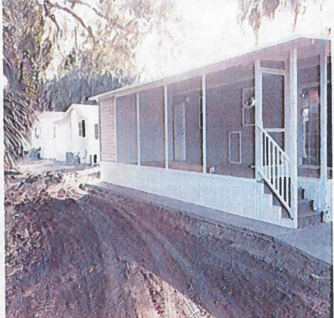
LEFT SIDE VIEW 11/08/2013