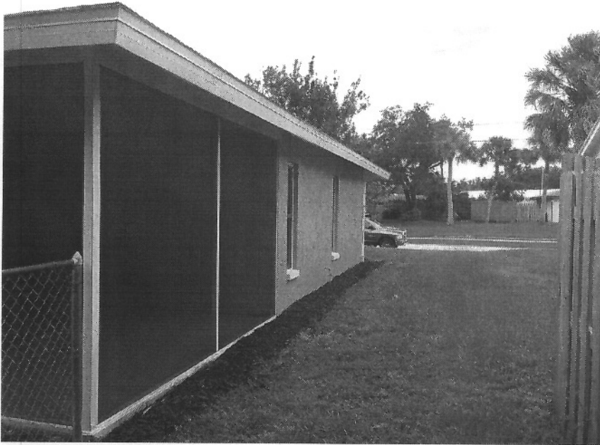
SOUTH SIDE 7-27-15