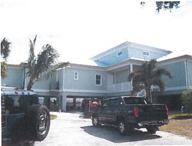
FRONT VIEW 5-18-10

If using the Elevation Certificate to obtain NFIP flood insurance, affix at least two building photographs below according to the instructions for Item A6. Identify all photographs with: date taken; "Front View" and "Rear View"; and, if required, "Right Side View" and "Left Side View." If submitting more photographs than will fit on this page, use the Continuation Page on the reverse.