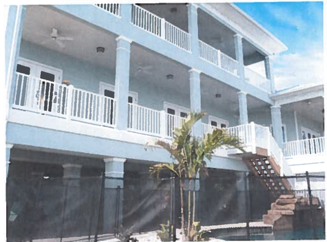
REAR VIEW 5-18-10