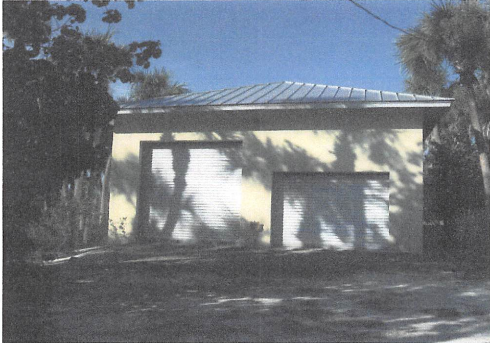
Rear View 2-21-2012