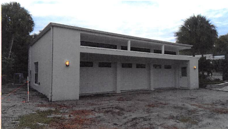
Front View 8-27-15

If using the Elevation Certificate to obtain NFIP flood insurance, affix at least two building photographs below according to the instructions for Item A6. Identify all photographs with: date taken; "Front View" and "Rear View"; and, if required, "Right Side View" and "Left Side View." If submitting more photographs than will fit on this page, use the Continuation Page, following.