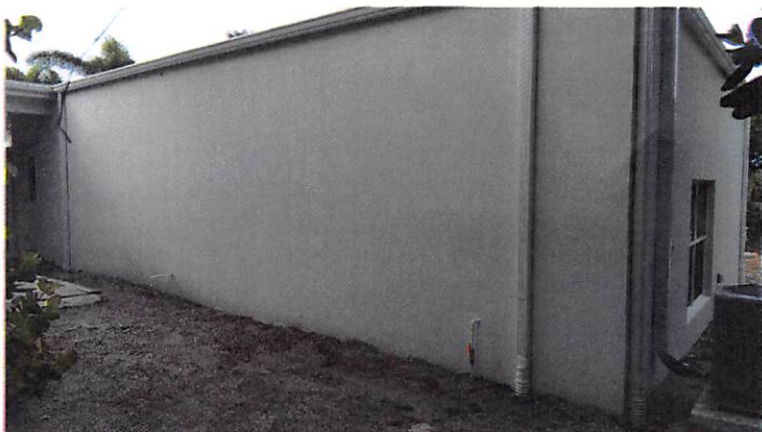
Rear View 8-27-2015