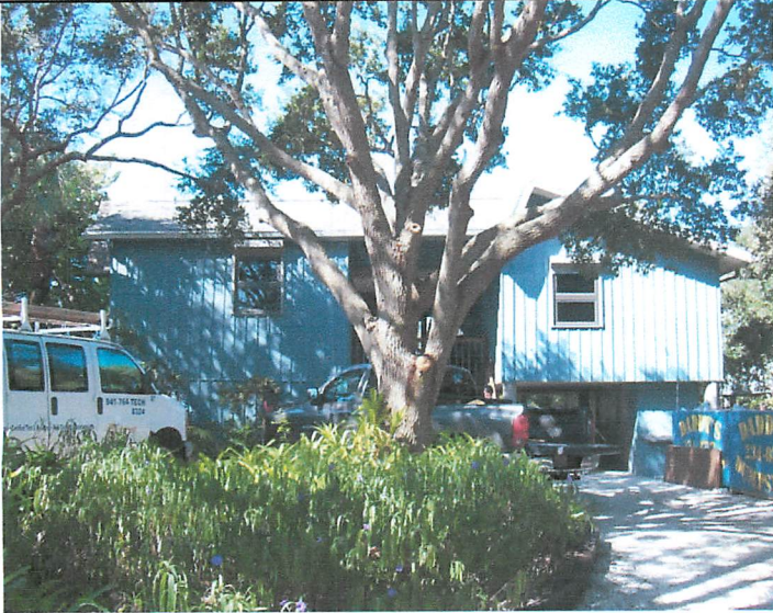
Front View 10/30/2013

If using the Elevation Certificate to obtain NFIP flood insurance, affix at least 2 building photographs below according to the instructions for Item A6. Identify all photographs with date taken; "Front View" and "Rear View"; and, if required, "Right Side View" and "Left Side View." When applicable, photographs must show the foundation with representative examples of the flood openings or vents, as indicated in Section A8. If submitting more photographs than will fit on this page, use the Continuation Page.