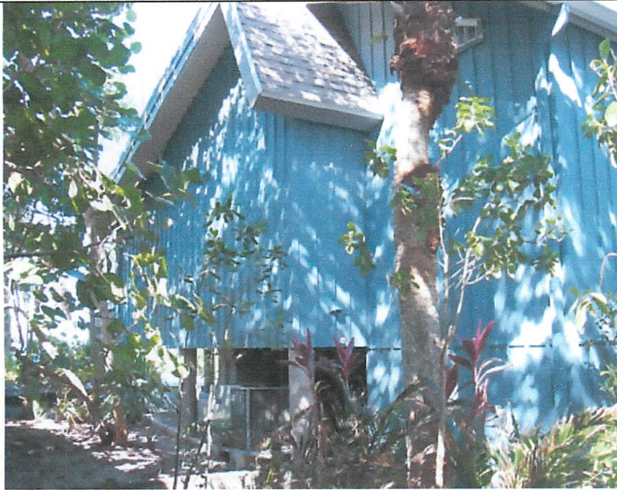
Side View 10/30/2013