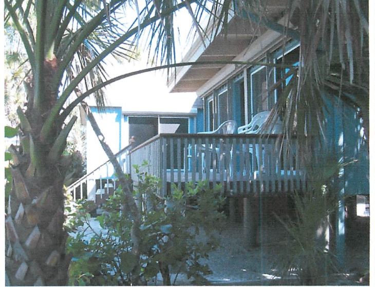
Rear View 10/30/2013