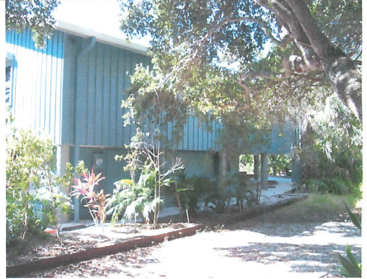
Side View 10/30/2013