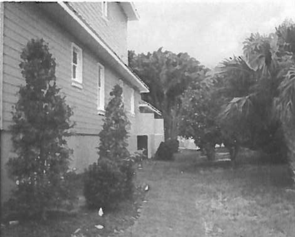
LEFT VIEW 5/21/09