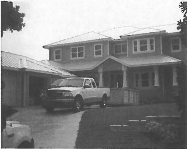
FRONT VIEW 5/21/09

If using the Elevation Certificate to obtain NFIP flood insurance, affix at least two building photographs below according to the instructions for Item A6. Identify all photographs with: date taken; "Front View" and "Rear View"; and, if required, "Right Side View" and "Left Side View." If submitting more photographs than will fit on this page, use the Continuation Page on the reverse.