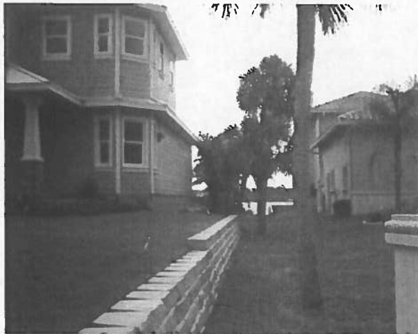
RIGHT VIEW 5/21/09