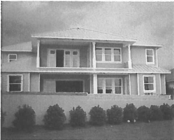
REAR VIEW 5/21/09