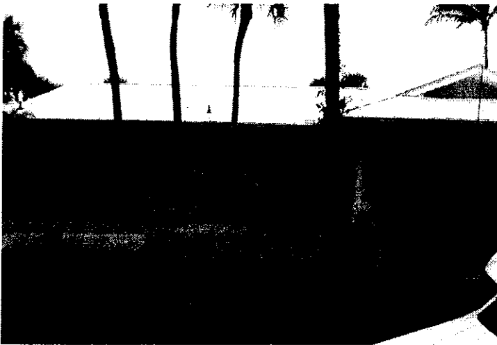
FRONT VIEW 2-27-15

If using the Elevation Certificate to obtain NFIP flood insurance, affix at least 2 building photographs below according to the instructions for Item A6. Identify all photographs with date taken; "Front View" and "Rear View"; and, if required, "Right Side View" and "Left Side View." When applicable, photographs must show the foundation with representative examples of the flood openings or vents, as indicated in Section A8. If submitting more photographs than will fit on this page, use the Continuation Page.