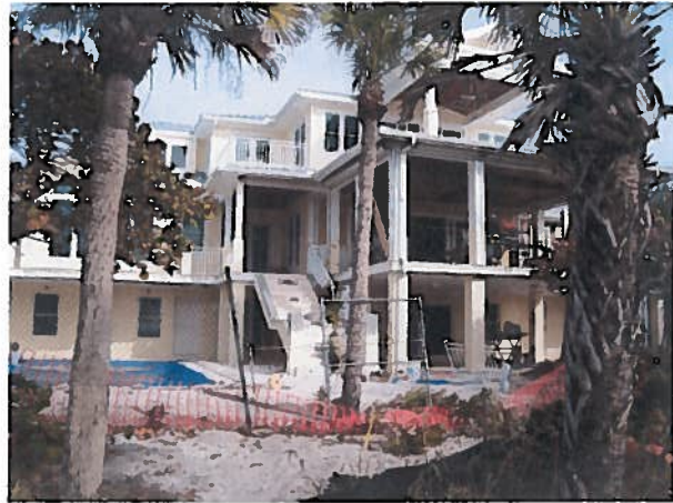
REAR VIEW 1-12-11