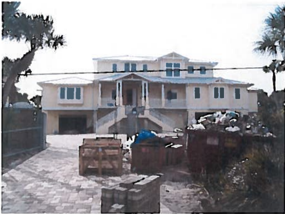
FRONT VIEW 1-12-11