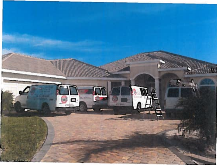
FRONT VIEW 1-13-15

If using the Elevation Certificate to obtain NFIP flood insurance, affix at least 2 building photographs below according to the instructions for Item A6. Identify all photographs with date taken; "Front View" and "Rear View"; and, if required, "Right Side View" and "Left Side View." When applicable, photographs must show the foundation with representative examples of the flood openings or vents, as indicated in Section A8. If submitting more photographs than will fit on this page, use the Continuation Page.