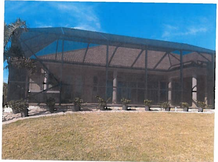
REAR VIEW 1-13-15