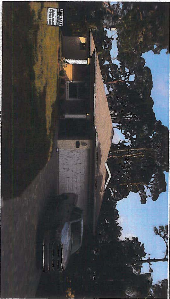
FRONT VIEW 05-13-2019

If using the Elevation Certificate to obtain NFIP flood insurance, affix at least 2 building photographs below according to the instructions for Item A6. Identify all photographs with date taken; "Front View" and "Rear View"; and, if required, "Right Side View" and "Left Side View." When applicable, photographs must show the foundation with representative examples of the flood openings or vents, as indicated in Section A8. If submitting more photographs than will fit on this page, use the Continuation Page.