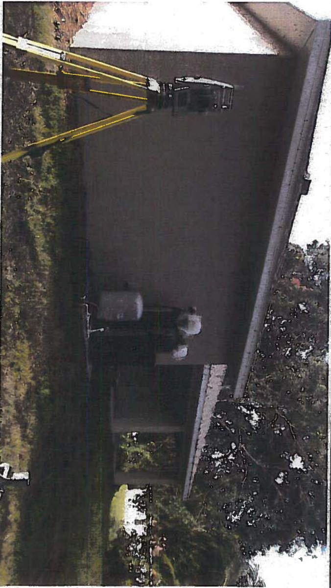
REAR VIEW 05-13-2019