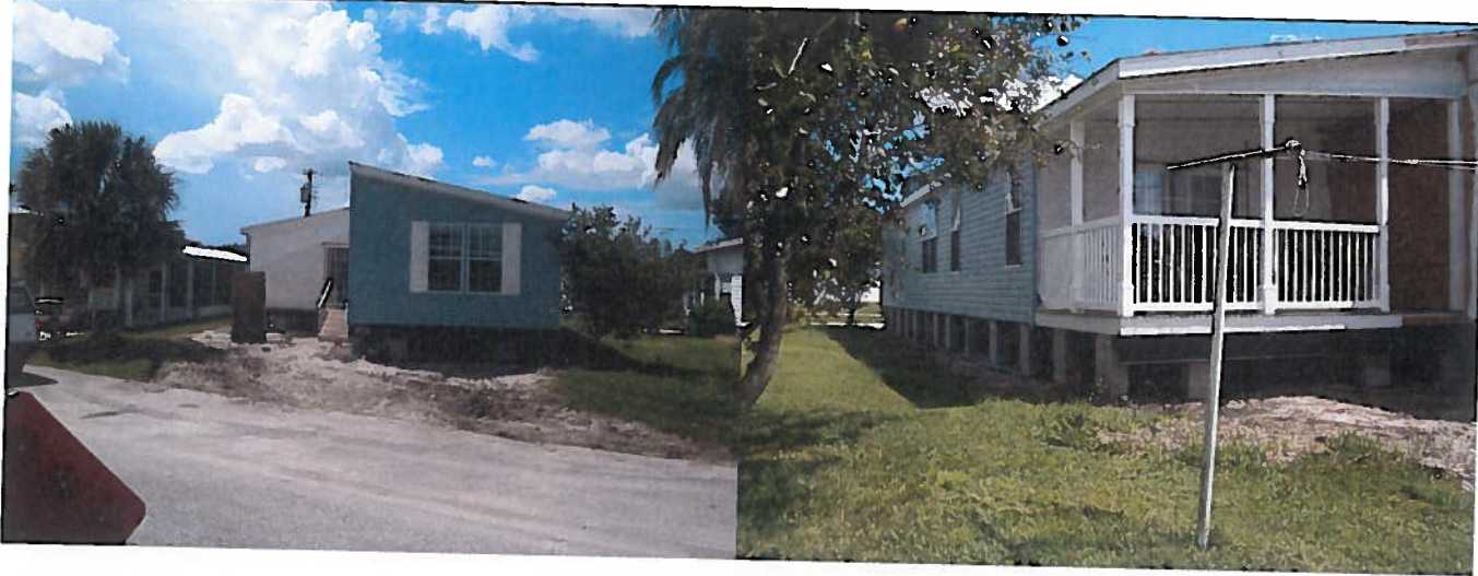
FRONT VIEW 9/28/09

If using the Elevation Certificate to obtain NFIP flood insurance, affix at least two building photographs below according to the instructions for Item A6. Identify all photographs with: date taken; "Front View" and "Rear View"; and, if required, "Right Side View" and "Left Side View." If submitting more photographs than will fit on this page, use the Continuation Page on the reverse.