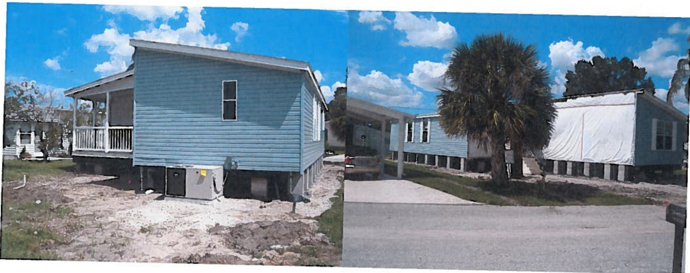
REAR VIEW 9/28/09