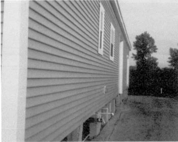
LEFT SIDE VIEW 12/31/14