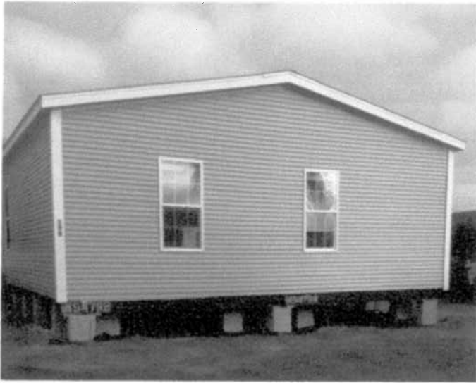
REAR VIEW 12/31/14