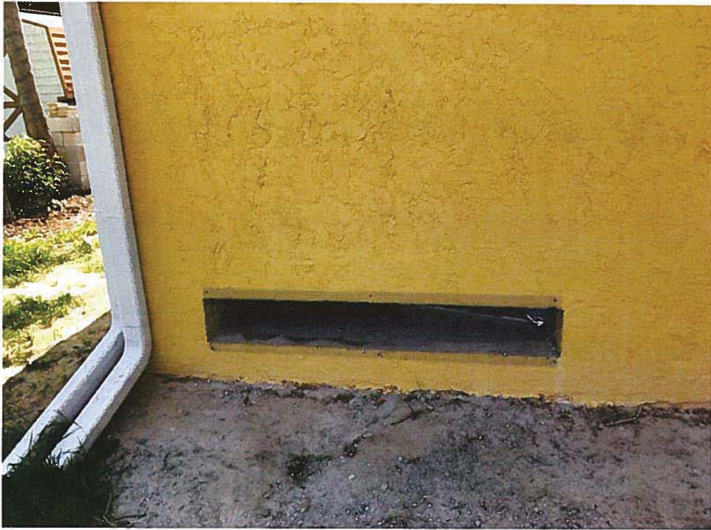
Styrofoam removed from flow through openings.