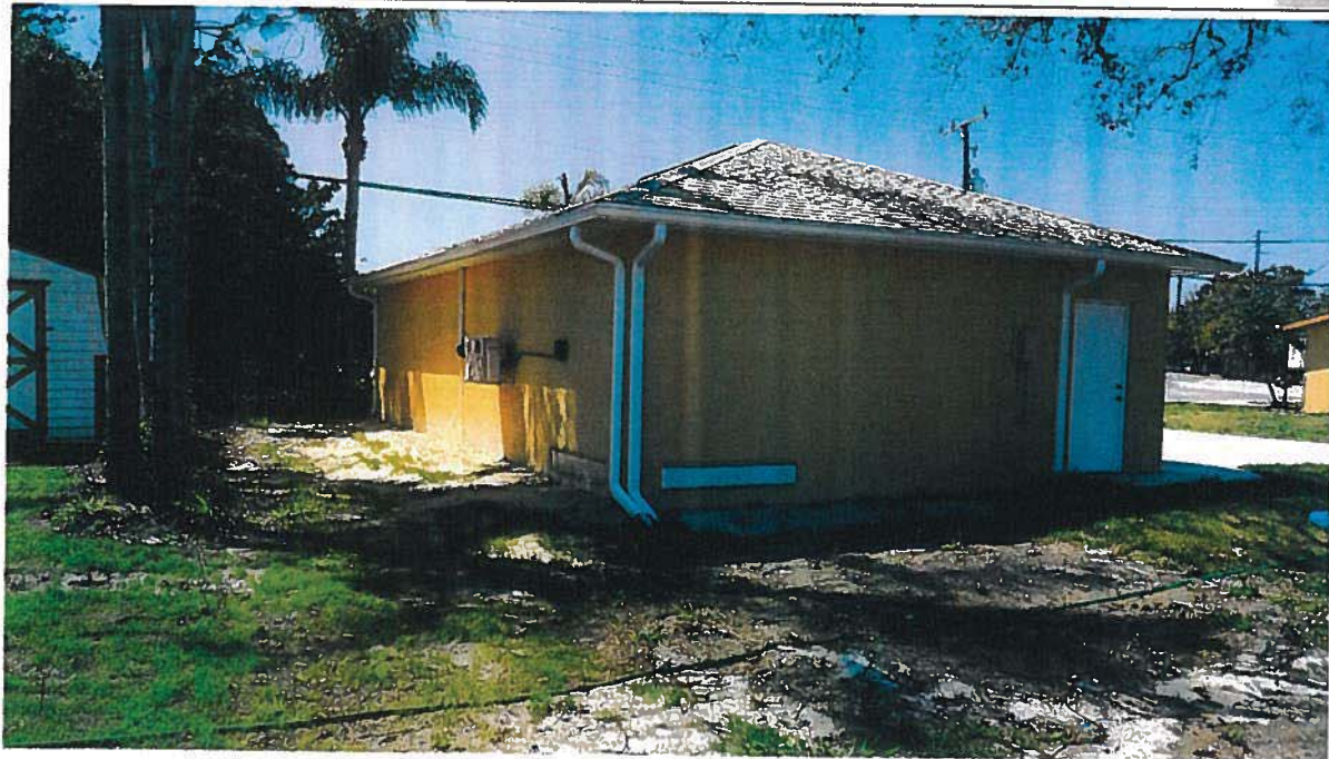
REAR VIEW 03/21/17