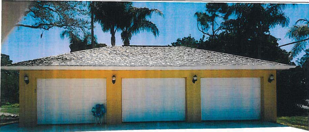
FRONT VIEW 03/21/17

If using the Elevation Certificate to obtain NFIP flood insurance, affix at least 2 building photographs below according to the instructions for Item A6. Identify all photographs with date taken; "Front View" and "Rear View"; and, if required, "Right Side View" and "Left Side View." When applicable, photographs must show the foundation with representative examples of the flood openings or vents, as indicated in Section A8. If submitting more photographs than will fit on this page, use the Continuation Page.