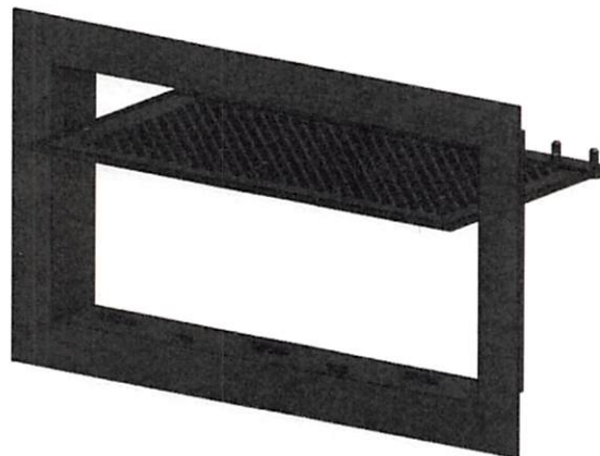
FIGURE 2—MODEL FFV-1608 FREEDOM FLOOD VENT®: SHOWN WITH FLOOD DOOR PIVOTED OPEN