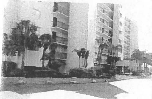
FRONT VIEW 4/29/10