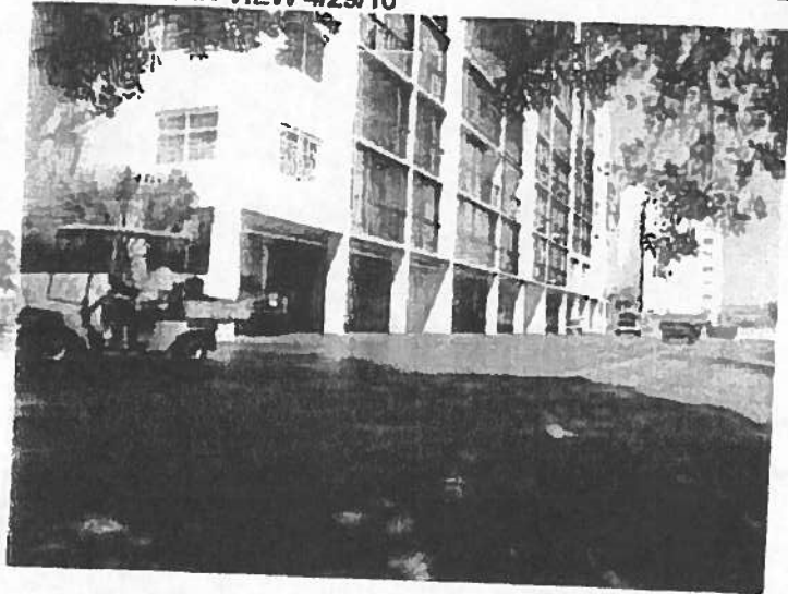
REAR VIEW 4/29/10