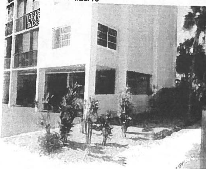
LEFT SIDE VIEW 4/29/10