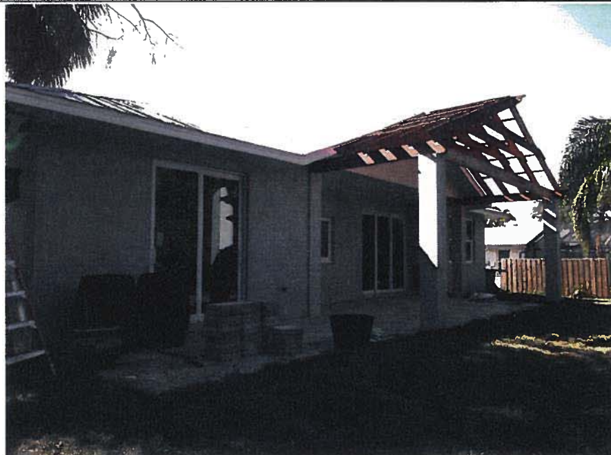
REAR VIEW 01/24/18