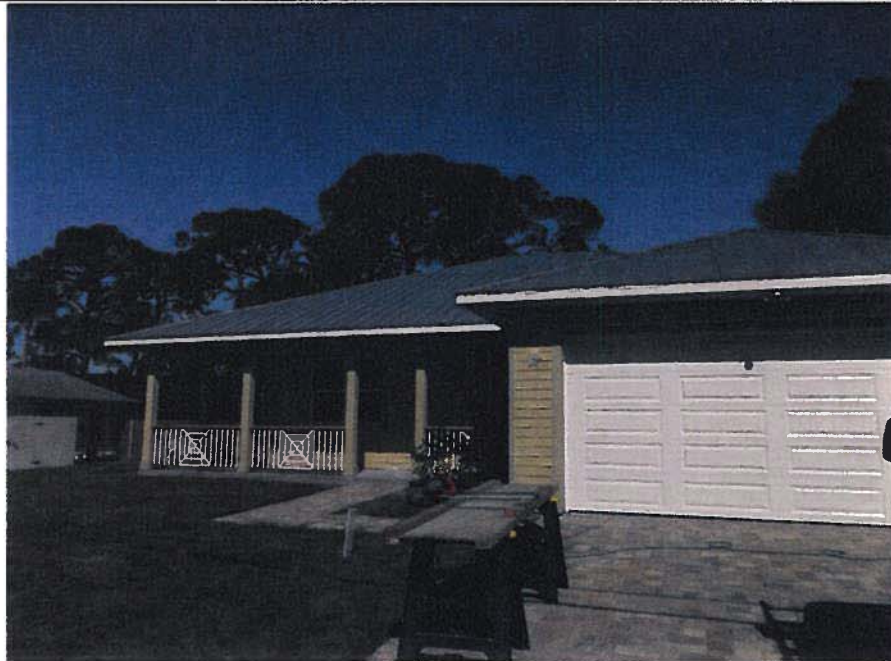
FRONT VIEW 01/24/18

If using the Elevation Certificate to obtain NFIP flood insurance, affix at least 2 building photographs below according to the instructions for Item A6. Identify all photographs with date taken; "Front View" and "Rear View"; and, if required, "Right Side View" and "Left Side View." When applicable, photographs must show the foundation with representative examples of the flood openings or vents, as indicated in Section A8. If submitting more photographs than will fit on this page, use the Continuation Page.