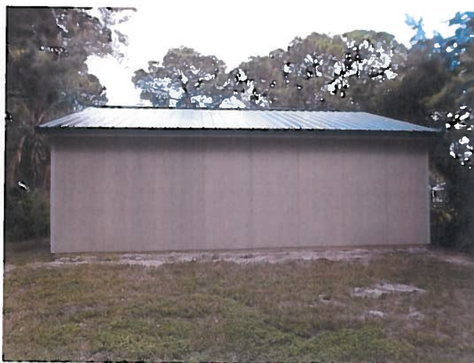
REAR VIEW 10-13-14