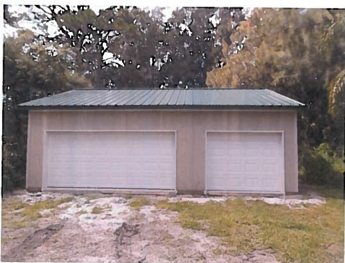
FRONT VIEW 10-13-14