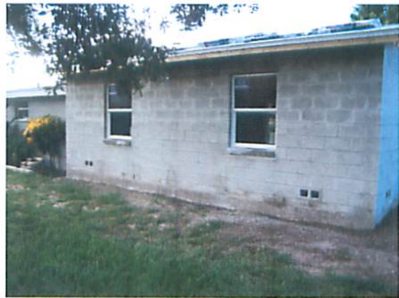
REAR VIEW 8-18-11