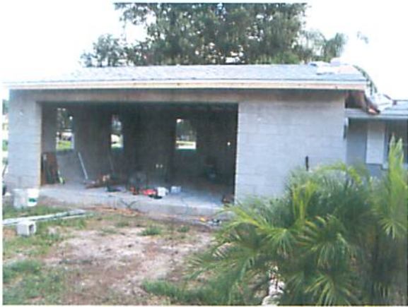
FRONT VIEW 8-18-11

If using the Elevation Certificate to obtain NFIP flood insurance, affix at least two building photographs below according to the instructions for Item A6. Identify all photographs with: date taken; "Front View" and "Rear View"; and, if required, "Right Side View" and "Left Side View." If submitting more photographs than will fit on this page, use the Continuation Page on the reverse.