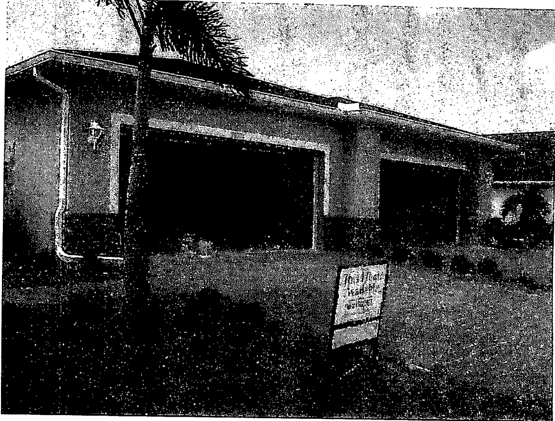
FRONT PICTURE (4/27/11)

If using the Elevation Certificate to obtain NFIP flood insurance, affix at least two building photographs below according to the instructions for Item A6. Identify all photographs with: date taken; "Front View" and "Rear View"; and, if required, "Right Side View" and "Left Side View." If submitting more photographs than will fit on this page, use the Continuation Page on the reverse.