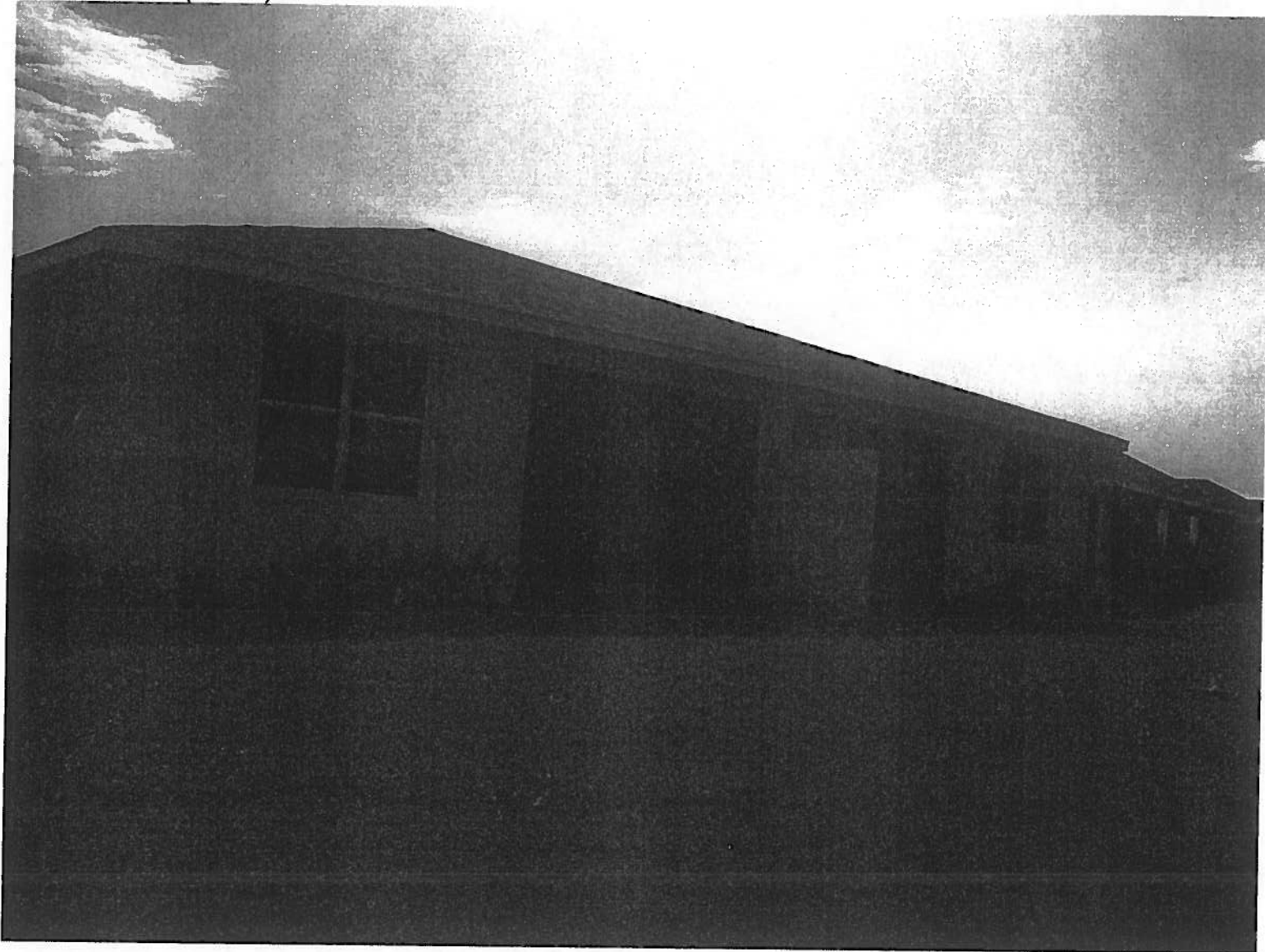
REAR PICTURE (4/29/10)