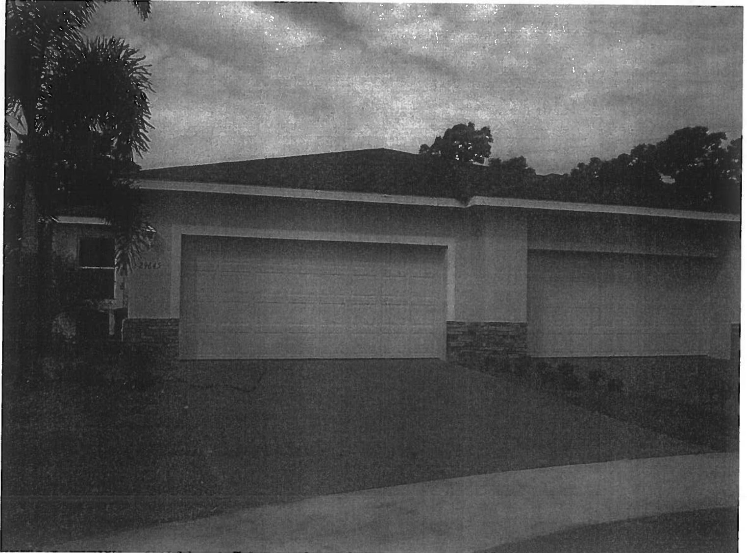
FRONT PICTURE (4/29/10)

If using the Elevation Certificate to obtain NFIP flood insurance, affix at least two building photographs below according to the instructions for Item A6. Identify all photographs with: date taken; "Front View" and "Rear View"; and, if required, "Right Side View" and "Left Side View." If submitting more photographs than will fit on this page, use the Continuation Page on the reverse.