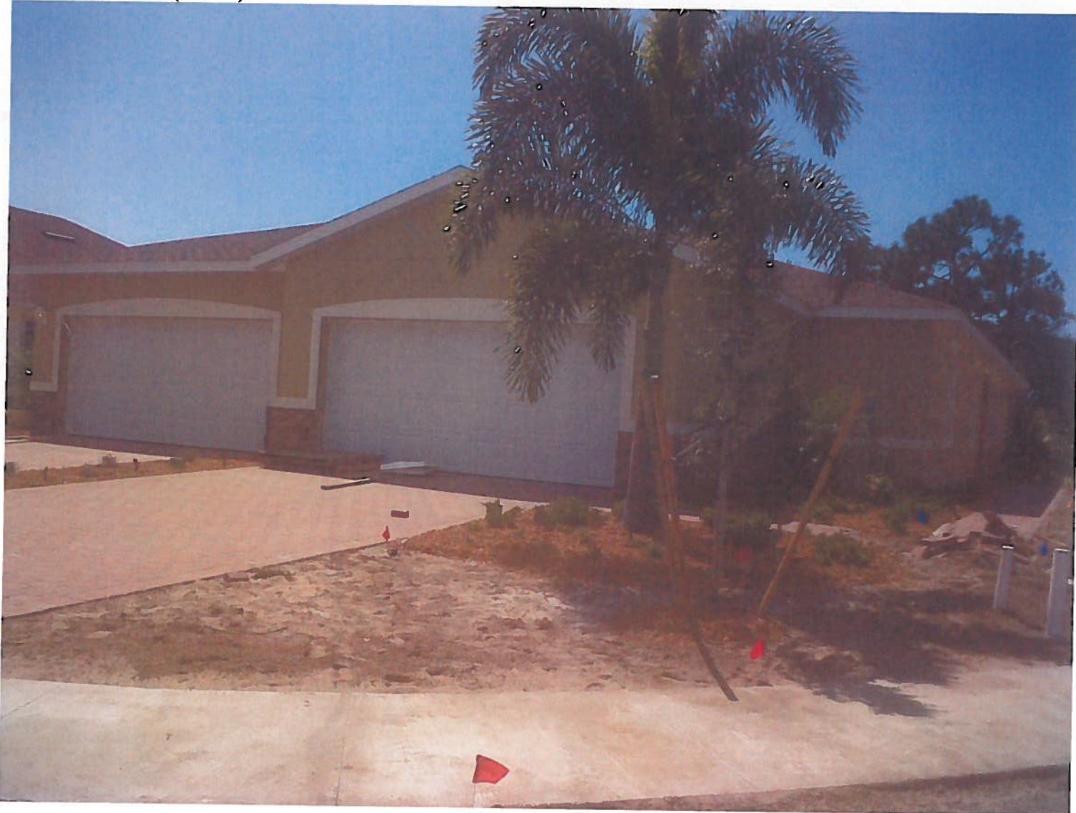
FRONT PICTURE (3/19/10)

If using the Elevation Certificate to obtain NFIP flood insurance, affix at least two building photographs below according to the instructions for Item A6. Identify all photographs with: date taken; "Front View" and "Rear View"; and, if required, "Right Side View" and "Left Side View." If submitting more photographs than will fit on this page, use the Continuation Page on the reverse.