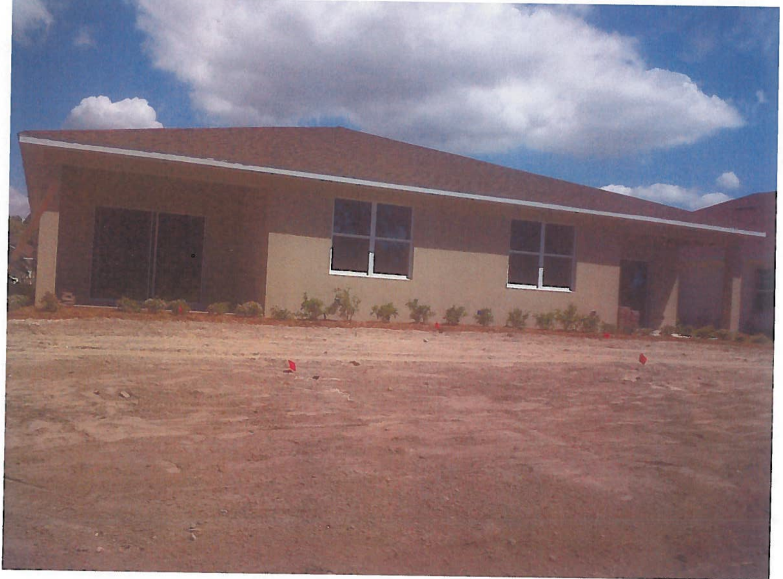
REAR PICTURE (3/19/10)