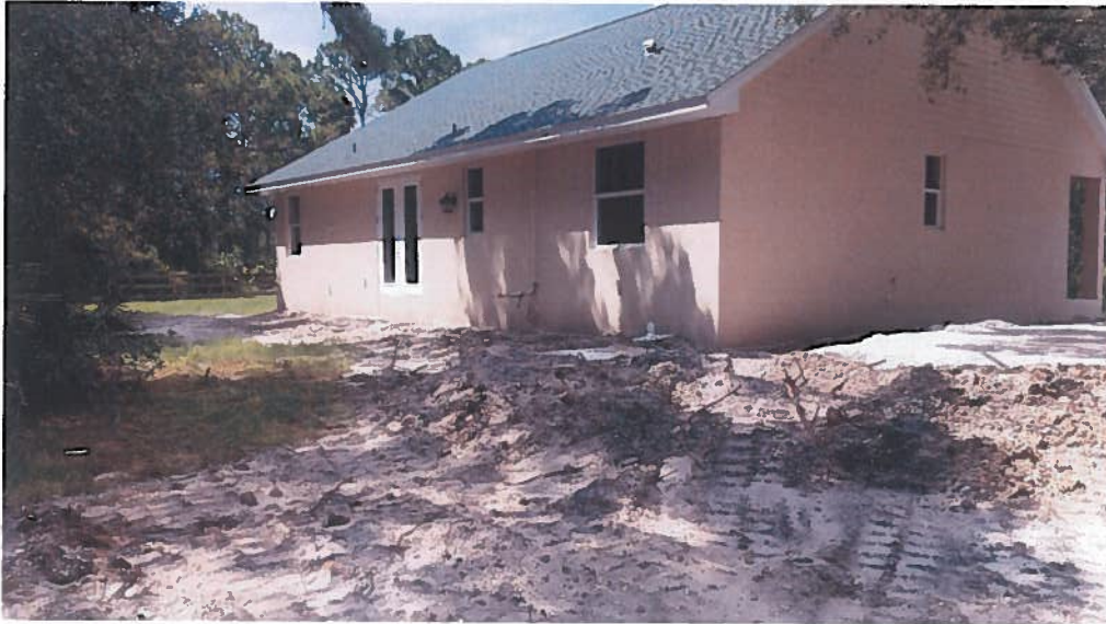
REAR VIEW 6/4/15

If submitting more photographs than will fit on the preceding page, affix the additional photographs below. Identify all photographs with: date taken; "Front View" and "Rear View"; and, if required, "Right Side View" and "Left Side View." When applicable, photographs must show the foundation with representative examples of the flood openings or vents, as indicated in Section A8.