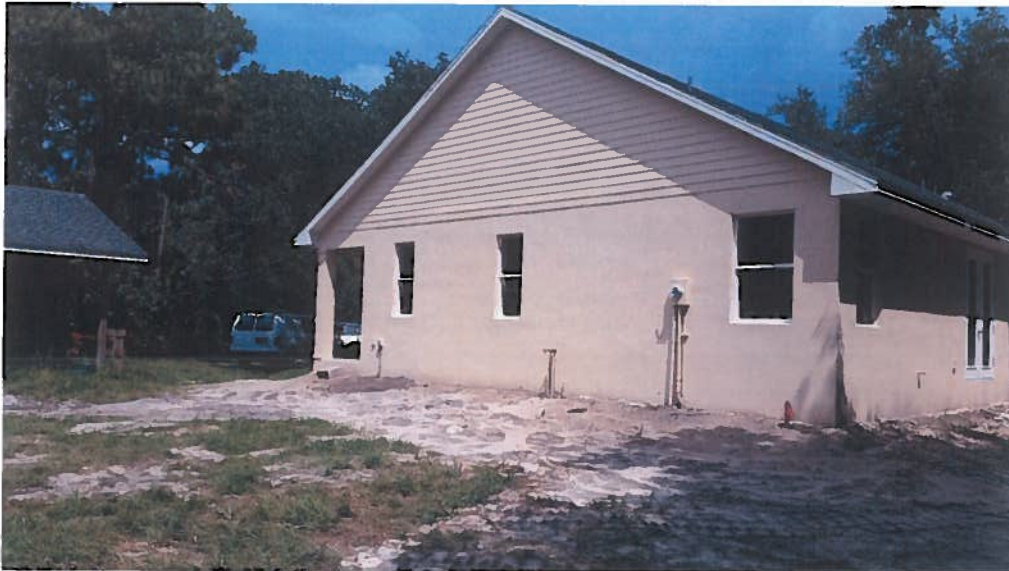
RIGHT SIDE VIEW 6/4/15