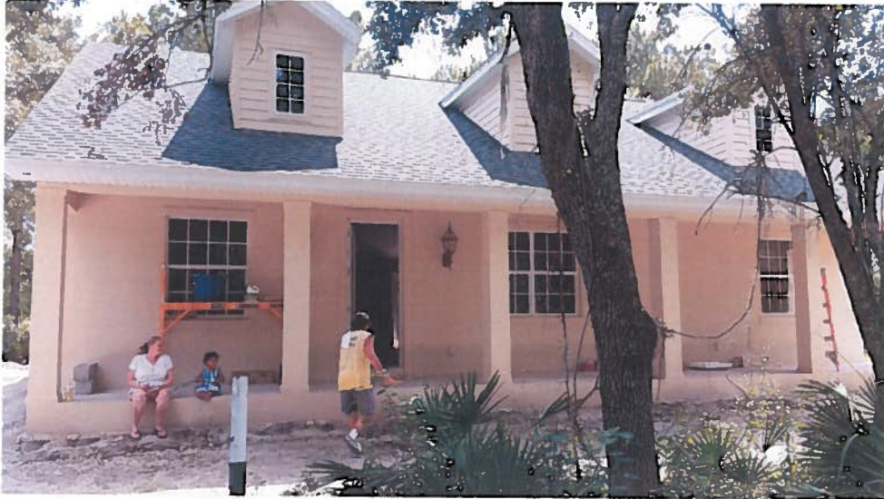
FRONT VIEW 6/4/15

If using the Elevation Certificate to obtain NFIP flood insurance, affix at least 2 building photographs below according to the instructions for Item A6. Identify all photographs with date taken; "Front View" and "Rear View"; and, if required, "Right Side View" and "Left Side View." When applicable, photographs must show the foundation with representative examples of the flood openings or vents, as indicated in Section A8. If submitting more photographs than will fit on this page, use the Continuation Page.