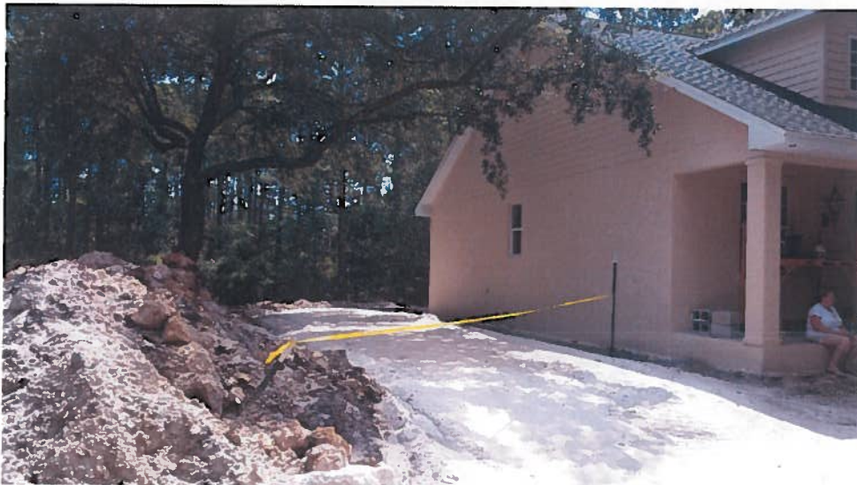
LEFT SIDE VIEW 6/4/15