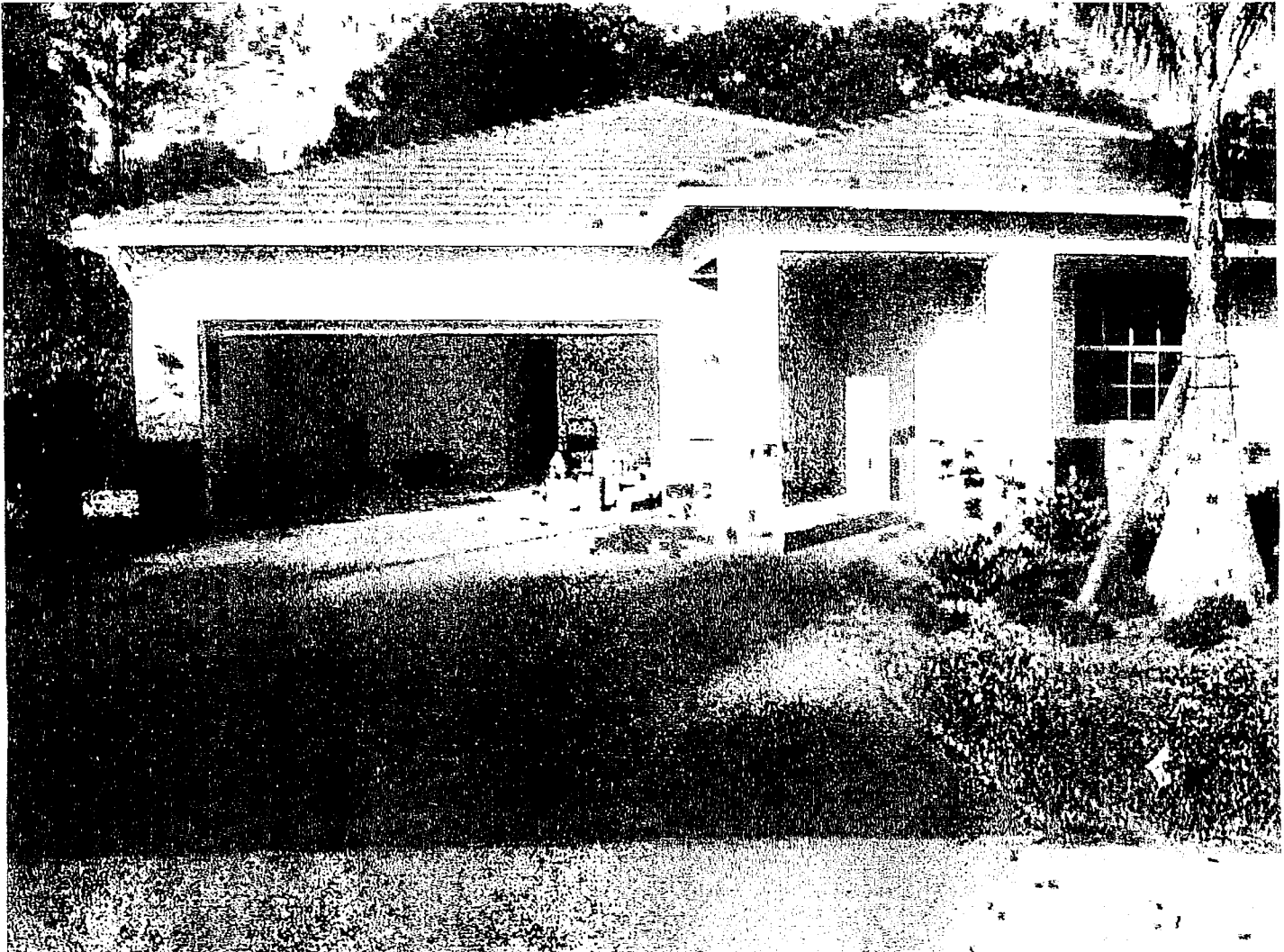
FRONT VIEW (8/19/11)

If using the Elevation Certificate to obtain NFIP flood insurance, affix at least two building photographs below according to the instructions for Item A6. Identify all photographs with: date taken; "Front View" and "Rear View"; and, if required, "Right Side View" and "Left Side View." If submitting more photographs than will fit on this page, use the Continuation Page on the reverse.